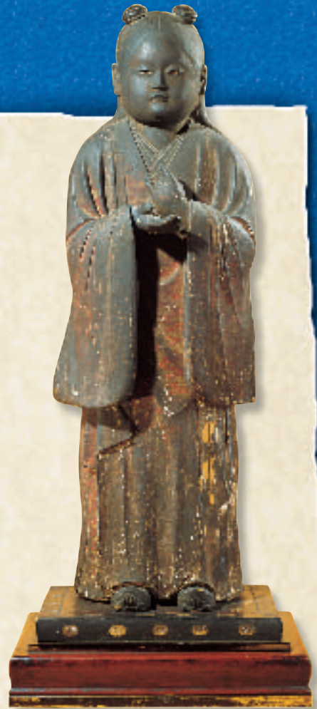
▲ Statue believed to be of Prince Shotoku

When Prince Shotoku died, the elderly people of the empire mourned as if they had lost a dear child of their own. A written account describes their words of grief: "The sun and moon have lost their brightness; heaven and earth have crumbled to ruin: henceforward, in whom shall we put our trust?"